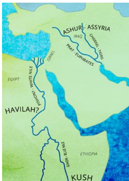
The Four Rivers

Now, it is written (Bereishis 2:10-11): “And a river came flowing out from Eden to give water to the Garden, and after it passed through the Garden, from there it splits up into four riverheads. The name of the first of these four rivers was Pishon (the Nile river) ...”.